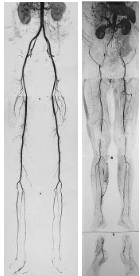
Figure 3: Normal MRA of Abdominal Aorta and Bilateral Lower Extremities.