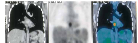
Figure 1b: Fusion of the chest CT and PET coronal imaging shows the abnormal activity in the paraesophageal area.