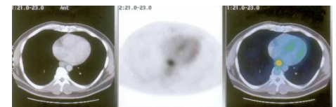
Figure 1a: Fusion of the chest CT and PET transaxial imaging shows an abnormal hypermetabolic focus in the posterior mediastinum.

This 39 year-old man was referred for staging of Hodgkin's lymphoma. A CT scan of the abdomen and pelvis showed a paraduodenal mass and mildly enlarged retroperitoneal lymph nodes. A PET scan showed abnormal activity regional to the paraduodenal mass and retroperitoneal lymph nodes. It also showed abnormal activity involving a paraesophageal mass. This posterior mediastinal mass initially could not be appreciated on the patient's chest CT scan as being separate from the normal esophagus. Thus, the PET scan significantly changed the staging of the patient's disease.